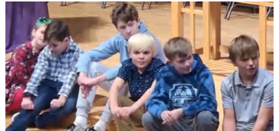
"WHAT IS IN THE BOX?"

BLESSED TO BE A BLESSING. HAPPY NEW YEAR!