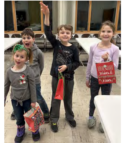
KIDS NIGHT OUT