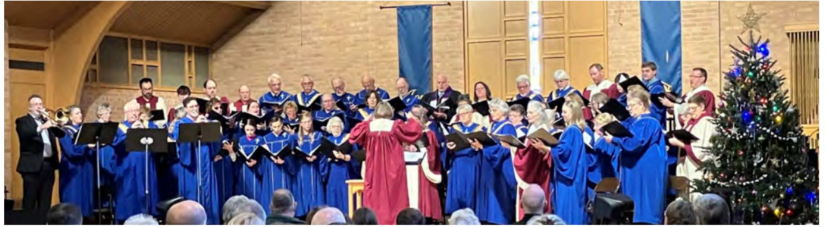
"SING JOY" CONCERT HOSTED AT SALEM THIS YEAR