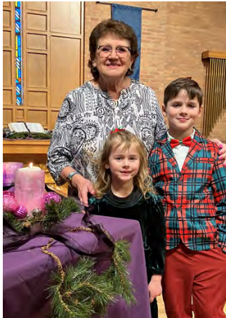
ADVENT CANDLE LIGHTING