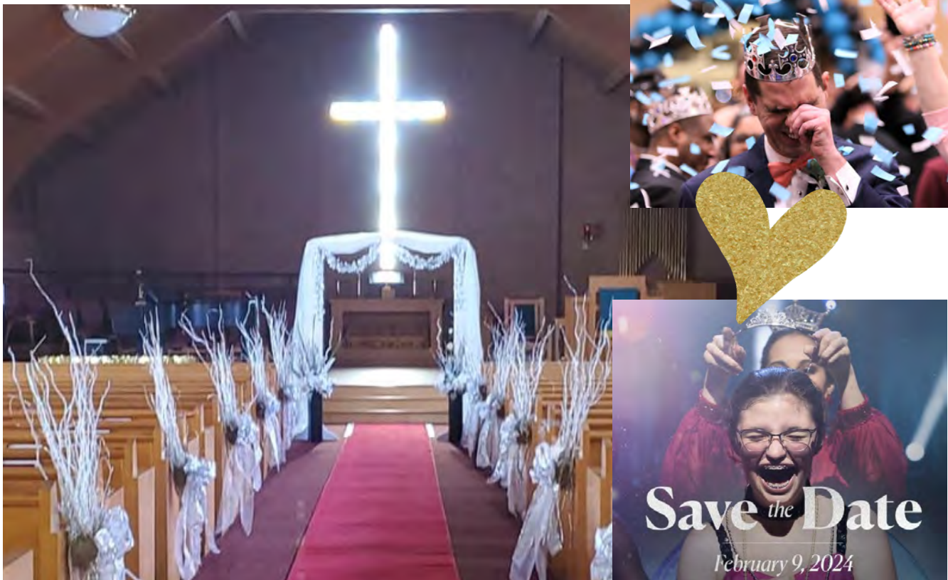
Pictured above: Salem UCC sanctuary decorated for Night to Shine 2023.