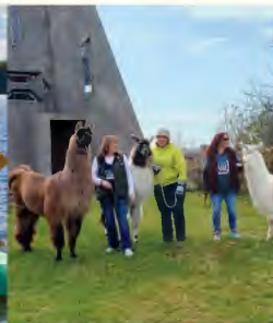
Cedar Valley West Bend, WI