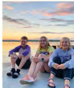
Daycholoh Center Ripon, WI

Event registration is open! Go to ucci.org