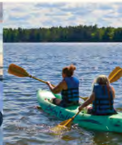
Moon Beach St. Germain, WI