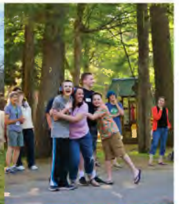
Camp AweSum Supporting Youth on the Autism Spectrum and their Families