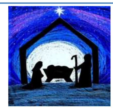
The First Christmas All Church Christmas Program

There is something special about this Christmas tradition that warms the heart. Join in the fun! We'll leave the Church at 4pm and meet up at Culver's after we've sung our hearts out ©