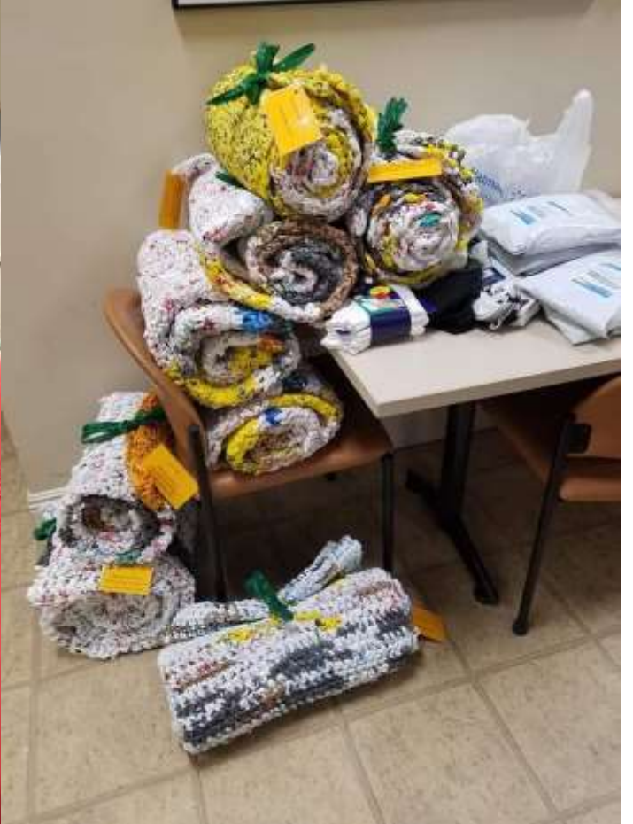
Donations for Back Bay Mission (2018 trip)